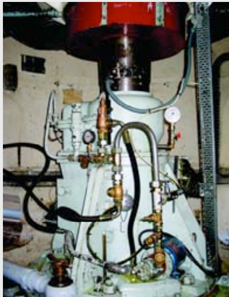
■ One of Bonnington's turbogenerators