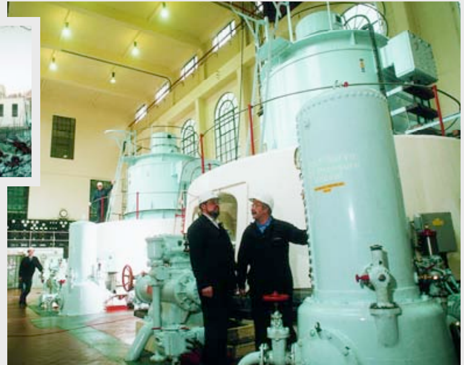
■ The turbine hall at Bonnington Power Station and, inset, an exterior shot of the station

If debris, such as branches, obstructs the flow of water into the stations, the “intelligent” control system will recognise this and cut off