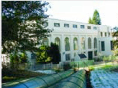
■ Bonnington Power Station (above) and the penstock pipes that feed water from Bonnington’s tilting weir (right)

The weir comprises three large gates that pivot on the river bed and are supported against the thrust of the water by counter balance weights.