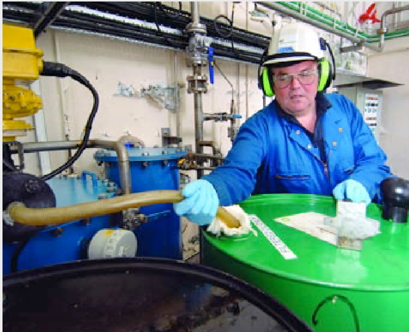
■ Waste oil is collected for purification and recycling at Bonnington Power Station

Lanark hydro-electric scheme Glenlee Power Station, New Galloway, Kirkcudbrightshire DG7 3SF telephone: 01644 430238 email: visit.hydros@scottishpower.com web: www.spenergywholesale.com