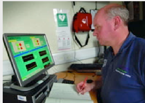
■ Checking the oil interceptor alarms (left) and, above, monitoring performance at Stonebyres