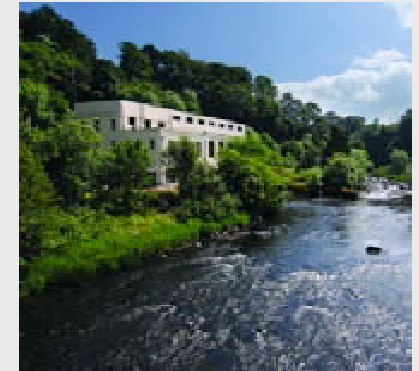
■ Stonebyres Power Station

Oil interceptor systems have been fitted to both stations to capture any oil, should a spill ever occur, before it enters the water course. Further efforts are made to reduce the use of