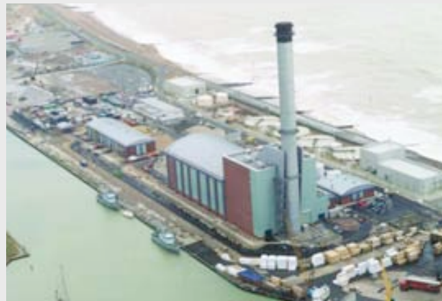
■ Shoreham's 106m chimney (left) is the tallest structure in West Sussex; above, the station from the west; right, the plant switchroom and boiler