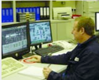
■ Shoreham's control room

In 2009, a new chlorine monitoring system was installed to more accurately measure the amount of sodium hypochlorite added to seawater used for cooling purposes to prevent the growth of mussels and other marine organisms.