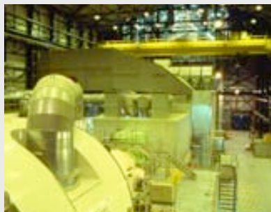
■ The turbine hall at Shoreham

⑦ The cooling water is discharged back into the English Channel through the refurbished outfall at Southwick Beach. This avoids the need for cooling towers. All of the steps in the process are highly automated and controlled and monitored constantly by operators from Shoreham's central control room.